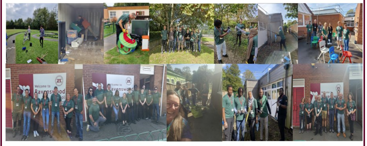
Baker Hughes Confidential